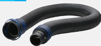
▶ BT-30 Length Adjusting