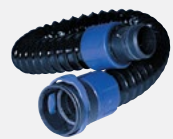
▶ BT-20S/37309 S/M (Approx. 28")