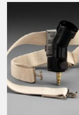
V-300/37019 Valve Assembly