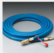
▶ 25 ft. W-9435-25/07010 ▶ 50 ft. W-9435-50/07011 ▶ 100 ft. W-9435-100/07012 ▶ 25 ft. W-9445-25 ▶ 50 ft. W-9445-50 ▶ 100 ft. W-9445-100 3/8" High-Pressure Hose