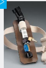
V-200 Vortemp™ Heating Assembly