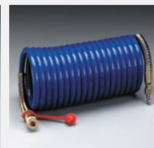
▶ 25 ft. W-2929-25 ▶ 50 ft. W-2929-50 ▶ 100 ft. W-2929-100 ▶ 25 ft. W-2929-25SR ▶ 50 ft. W-2929-50SR ▶ 100 ft. W-2929-100SR 3/8" High-Pressure Hose