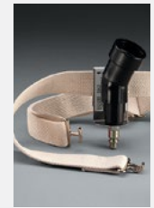
V-400/37020 Low-Pressure Assembly