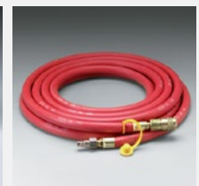
▶ 25 ft. W-3020-25/07033 ▶ 50 ft. W-3020-50/07034 ▶ 100 ft. W-3020-100/07035 1/2" Low-Pressure Hose