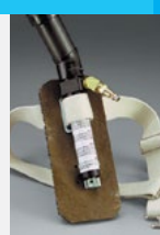
V-100/37018 Vortex Cooling Assembly