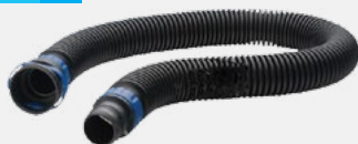
▶ BT-40 Heavy Duty