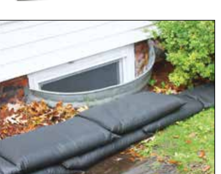
Just Add Water Activates at point of use when exposed to water