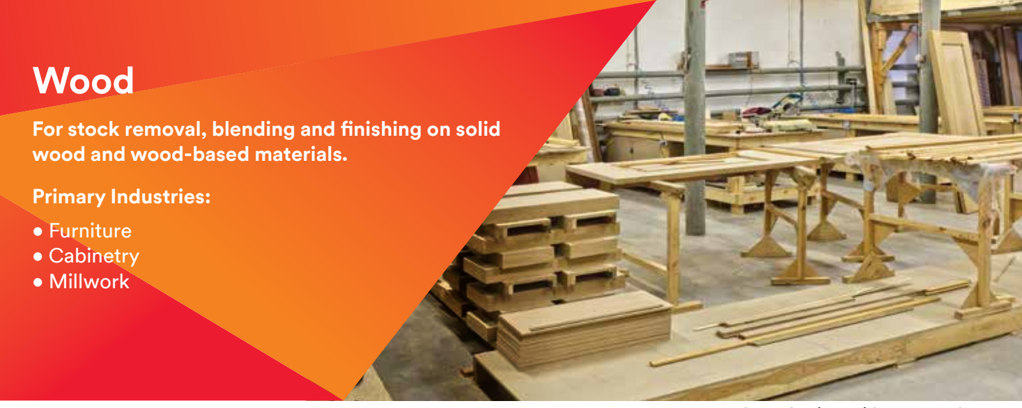
See selection guide on page 6.