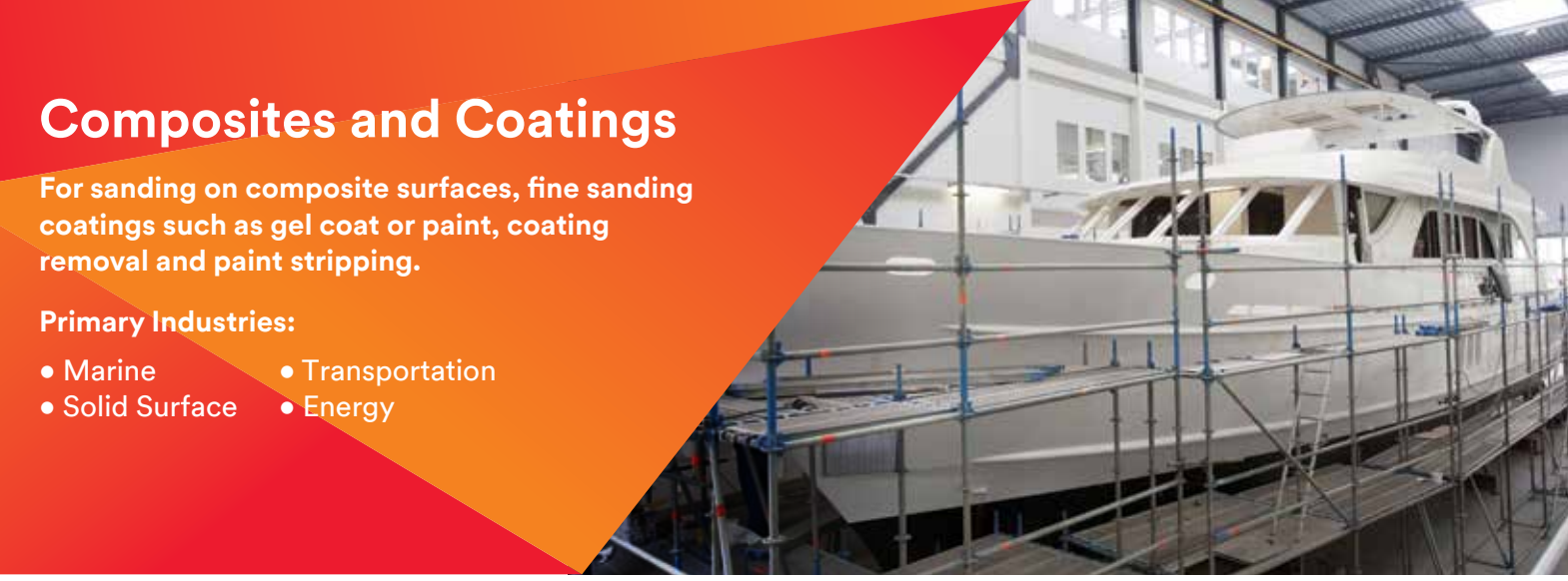
See selection guide on page 6.