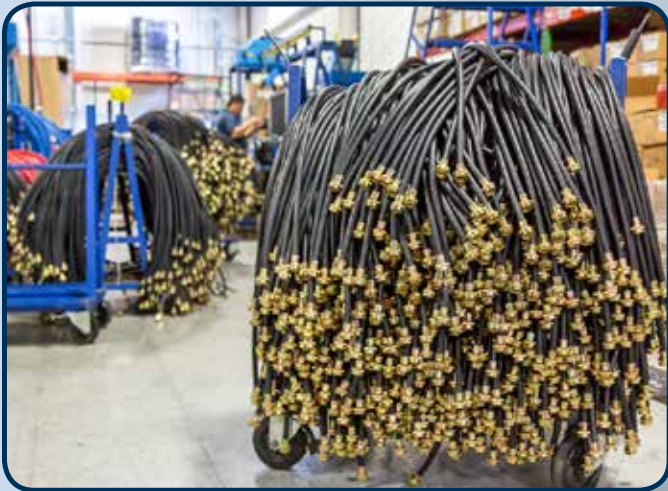
Producing hose assemblies in large quantities is a daily routine.