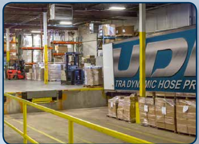
Shipping to customers world-wide with world-class hose and tubing products.