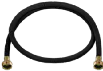
F X F