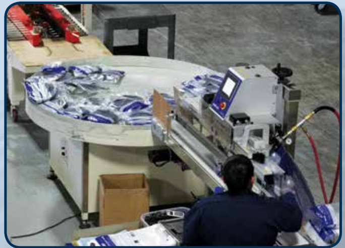
Complete packaging services available. Bagging, tagging and bar coding are just a few of the value added services we offer.