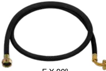
F X 90°