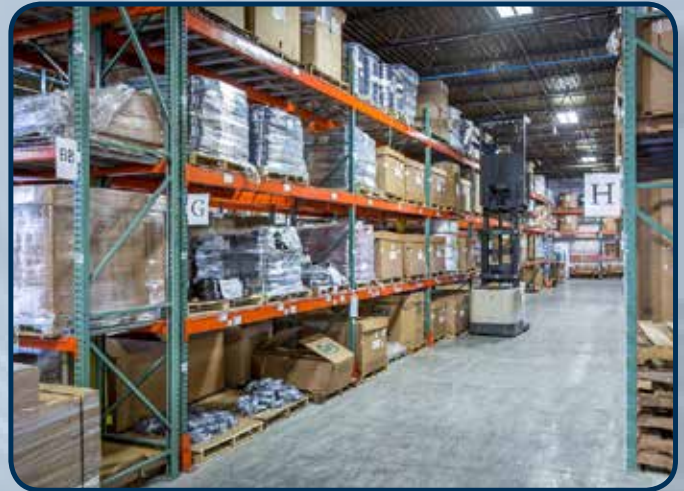
Inventory on-hand to service our customer needs. Large stocks for immediate shipment.