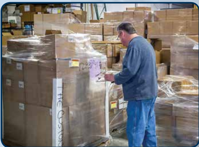
Inspection and quality is paramount with unparalleled customer service.