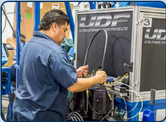
Hose assemblies fabricated to customer requirements - our specialty. Let us know what your requirements are.